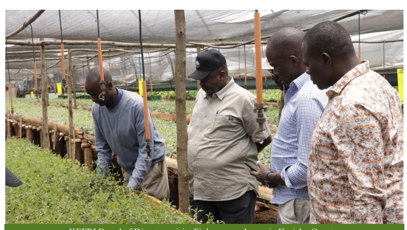
KEFRI Board of Directors visits Finlays greenhouse in Kericho County

The activity also extended to the Kamara establishment plot, providing a comprehensive overview of KEFRI's advancements in sustainable forestry practices.