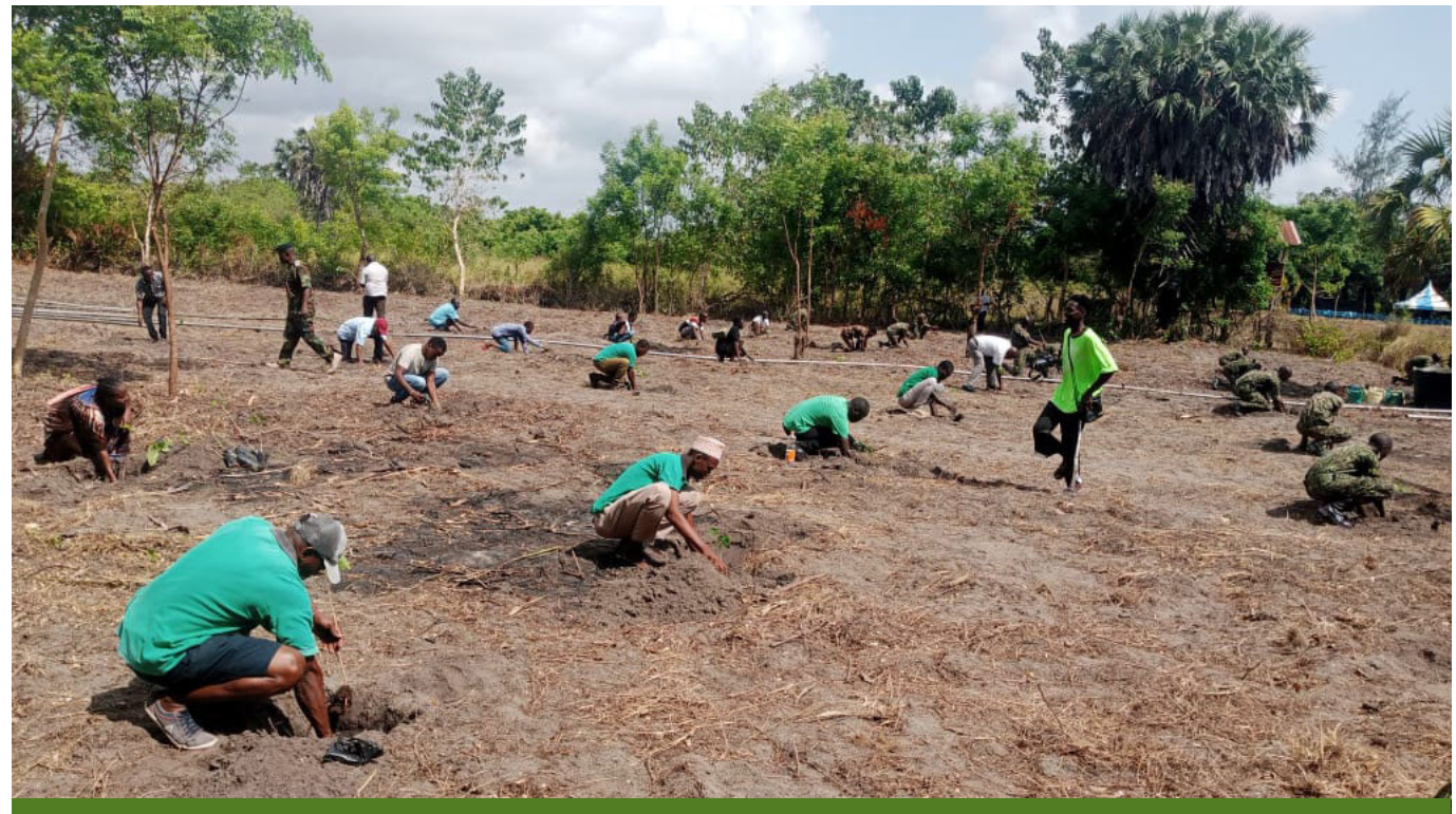
KEFRI staff from Lamu Sub-centre participates in tree planting at Hindi GK Prison to mark International Day of Forests 2024