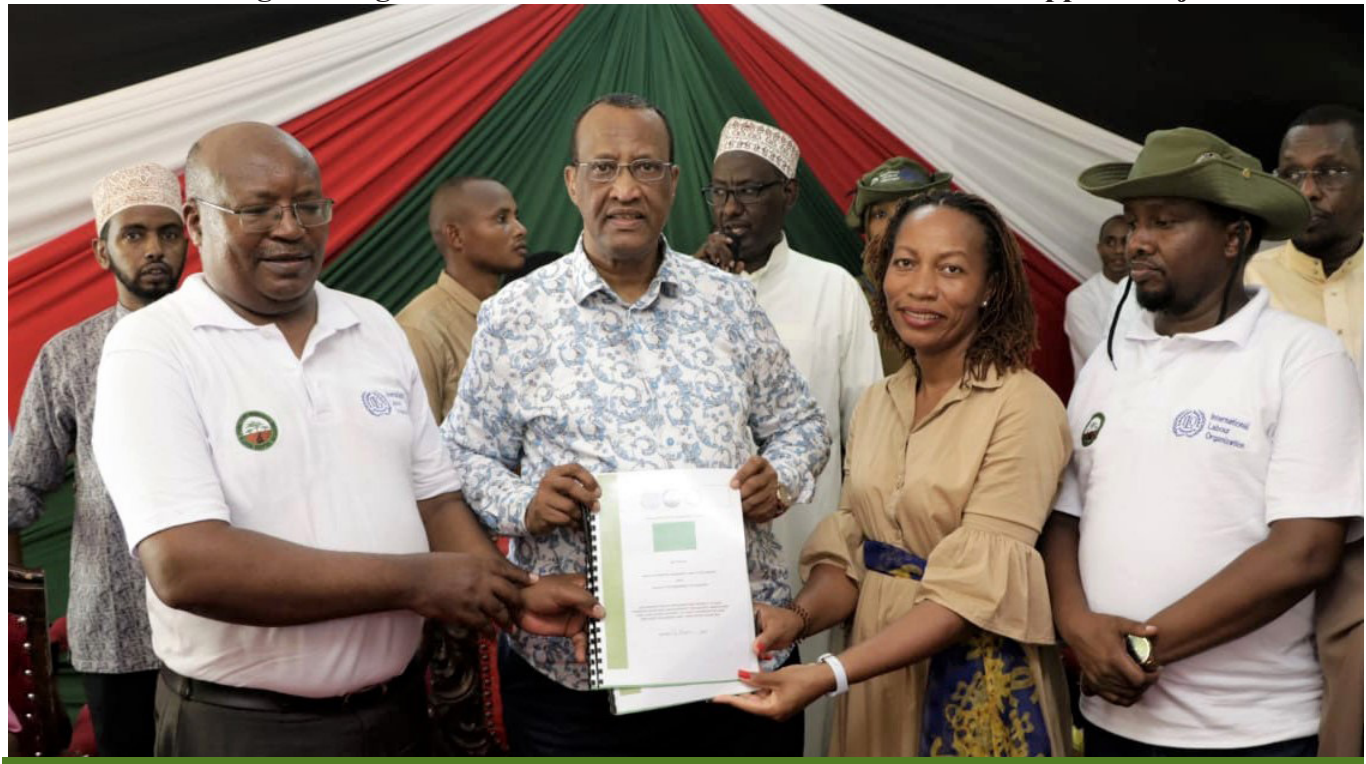
Garissa County Governor, International Labour Organization and KEFRI representatives sign Memorandum of Association

Launch of Mathenge Management for Decent Green Jobs and Livelihood Support Project